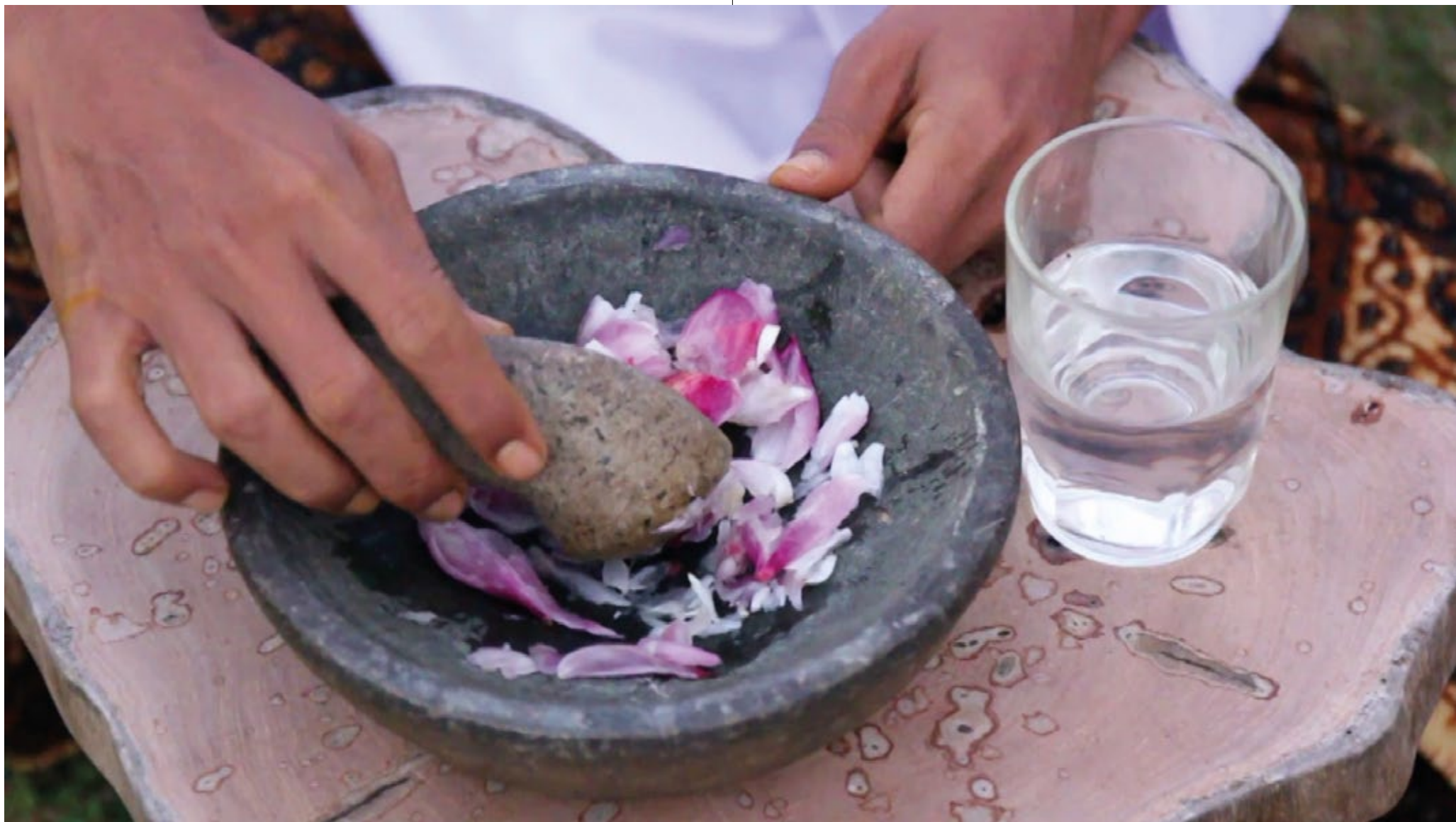
Lifepatch - Spectacular Healing (2019)