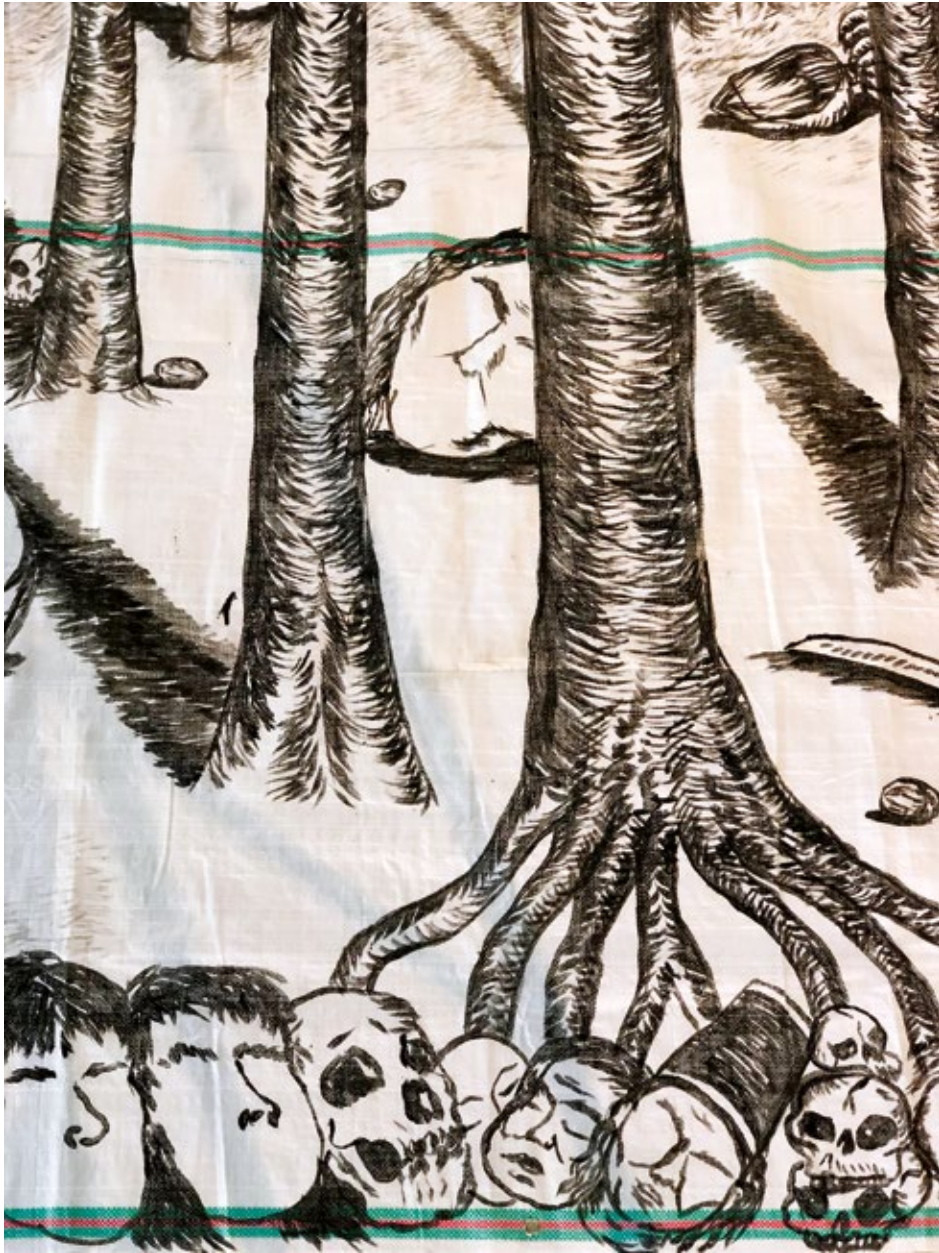
Ipeh Nur - Perken (2019)

classical European still life paintings downloaded from the internet. She turned historical pictures of the noble savage (a depicted character embodying indigenous or wild humans) into collages by adding contemporary features, showing that colonial dynamics continue to painfully exist today. The additions to the work add critical layers of meanings to the images and simultaneously transform them into new autonomous works of art.