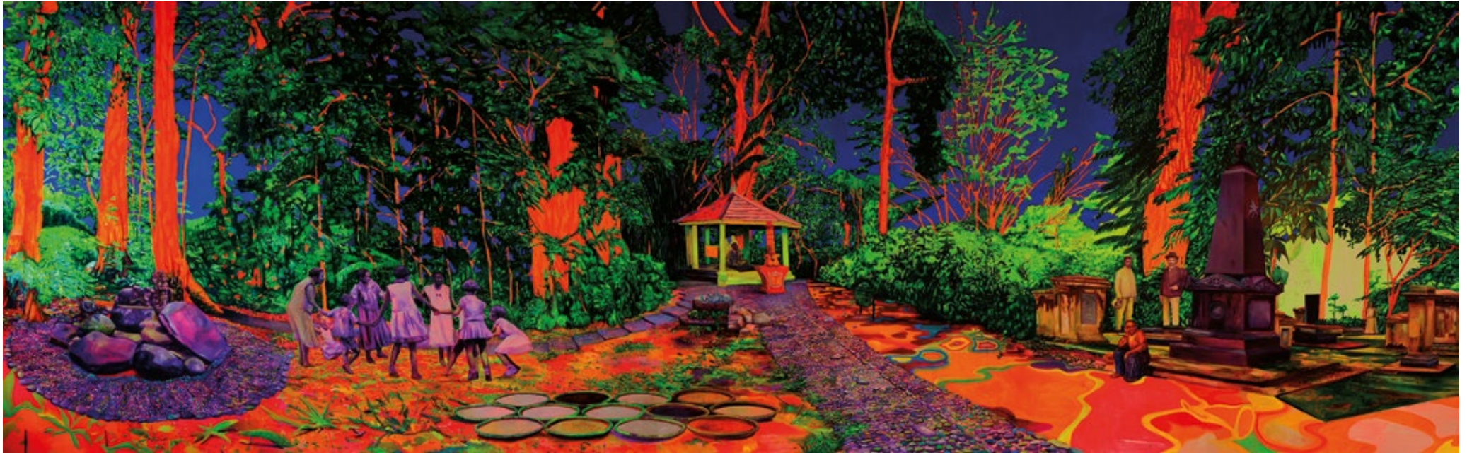
Zico Albaiquni - Ruwatan Tanah Air Beta, Reciting Rites in its Sites (2019), Courtesy of the artist & Yavuz Gallery