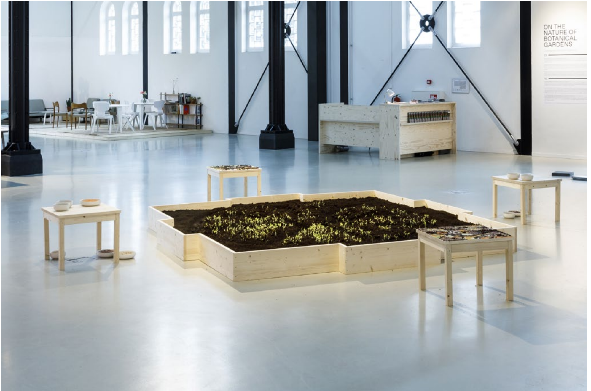
Arahmaiani - Memory of Nature (2013-2019)